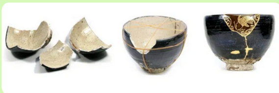
Kintsugi - Japanese art of repairing broken pottery

At ecoSurge we believe in the advantage of placing UN SDGs at businesses' core through digital and business innovation, and active cooperation (SDG 17). Only together we will be able to respond to today's challenges in a more uncertain and the vulnerable society.